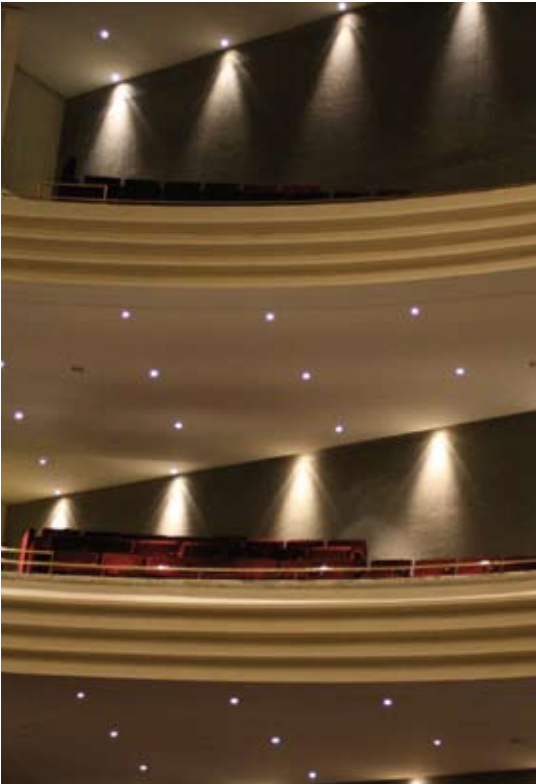
Nantes, 2 February 2007